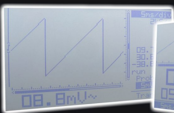
Normal screen with large DVM