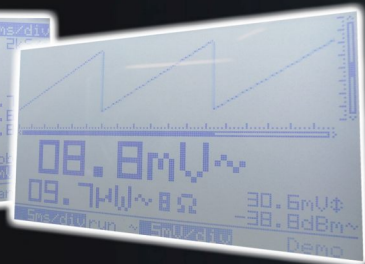
Wide screen with large DVM