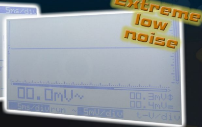
Wide screen with DVM